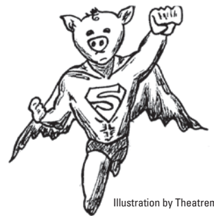
Illustration by Theatremuse