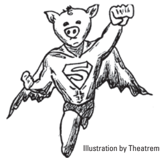
Illustration by Theatremuse