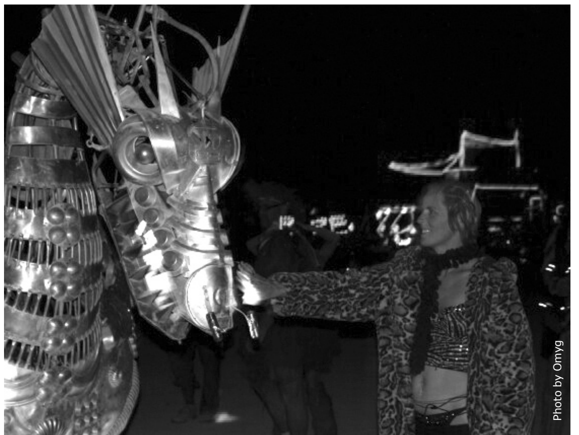
The Production Department's favorite playa sculpture so far.

Schedules are posted at each bus stop, marked by the red Nowhere Omnibus signs. 🐉